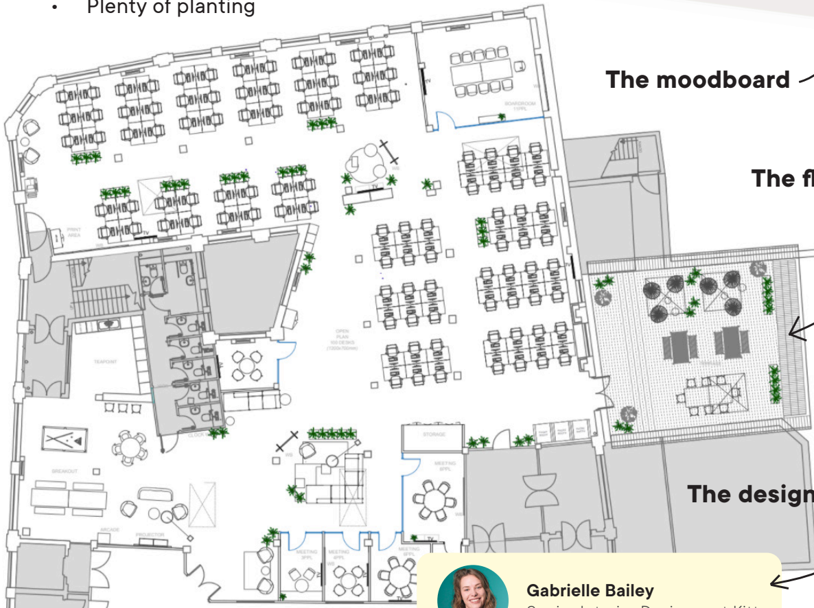
The design expert